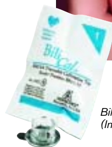
BiliCal™ (Individual Calibration Tip)